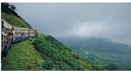
Matheran (83 kms)

Marine Drive in the city of Mumbai, It is a 'C'-shaped road along the coast, which is a natural bay. The road links Nariman Point to Babulnath and Malabar Hill. A promenade lies parallel to this road. Marine Drive is also known as the Queen's Necklace.