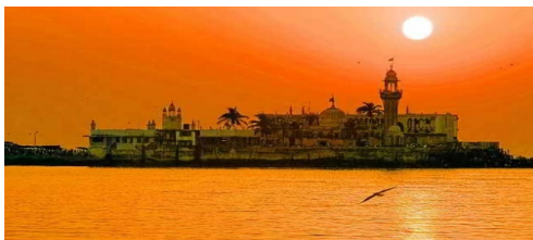
Haji Ali Dargah (Mumbai)