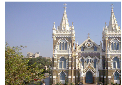
Mount Mary Church, Mumbai