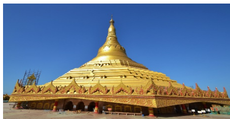
Global vipassana pagoda (Mumbai)