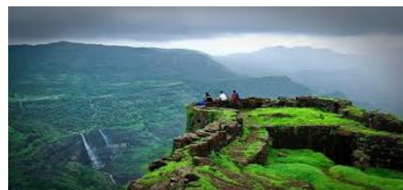
Lonavala (82 kms)