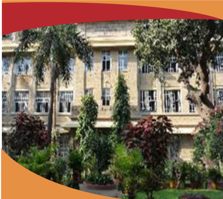
Seth GS Medical College & KEM Hospital